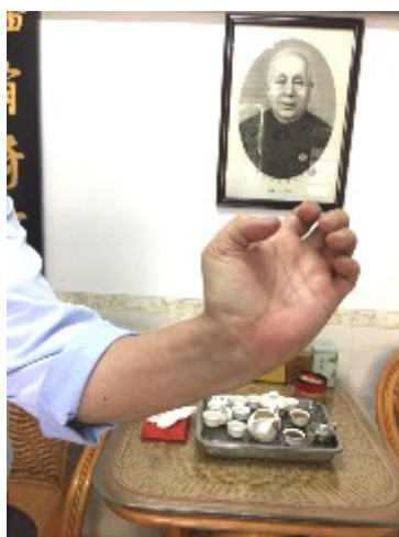
Illustration 3: 鹤爪中 He Zhua Zhong (crane claw centre – shuffling / step drag)