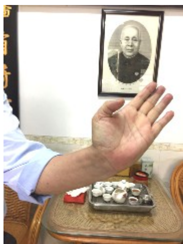
Illustration 2: 鹤翅中 Hè chī zhōng (crane wing centre – simplified ending)

is San Zhan which can simply be thought of as dealing with position and linear power drawing from the ground. The second is 13 Defences or 13 Shakes dealing predominantly with waist and shoulder rotational power. The third is 8 part hands which is 8 linked techniques reminiscent of Tensho in karate and expands ideas of in fighting. Following this there are techniques such as are mentioned in the bubishi like "iron ox enters the stone". Of the 22 forms of the syllabus of the wen gong ci lineage 14 are named are specific techniques revealed in them. One can easily understand stripping down the learning path for a practitioner who already had a library of techniques and concentrating on the 3 primal forms which teach the essence of the movement. This does not only apply to teaching Japanese students, but also passing the system to any cross training in FuZhou or for the travelling Yong Chun community. One aspect that does not tie with some of the goju ryu interpretations is that sanchiem is a hard form whereas tensho is a soft form. In White Crane the balance between hard and soft is to be found from the first form onwards – as stated in the book "white crane ancestor genuine techniques" ( circa 1790) : hard is soft, soft is hard.... 剛者柔, 柔者剛 . Regarding open verses closed fist hand, San Zhan is trained in 3 hand positions, open , closed and half closed.