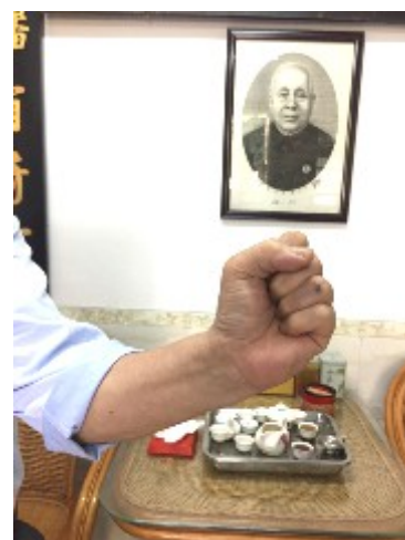
Illustration 4: 鹤头中 He Tou Zhong (crane head centre – current San Zhan ending)